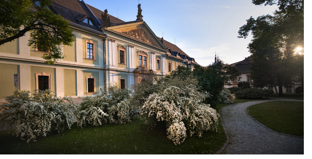
Zbrojnice UP ↑

the student and academic environment and institutions providing help to people who need it.