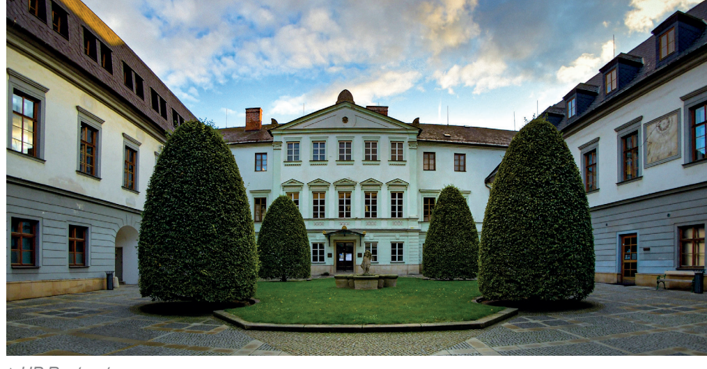
↑ UP Rectorate