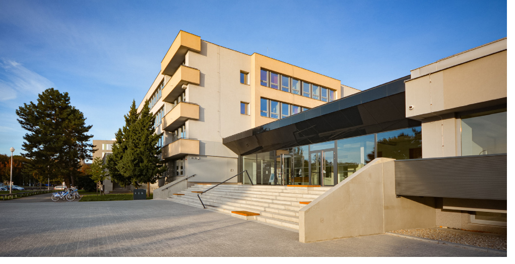
Faculty of Law – Building B ↑