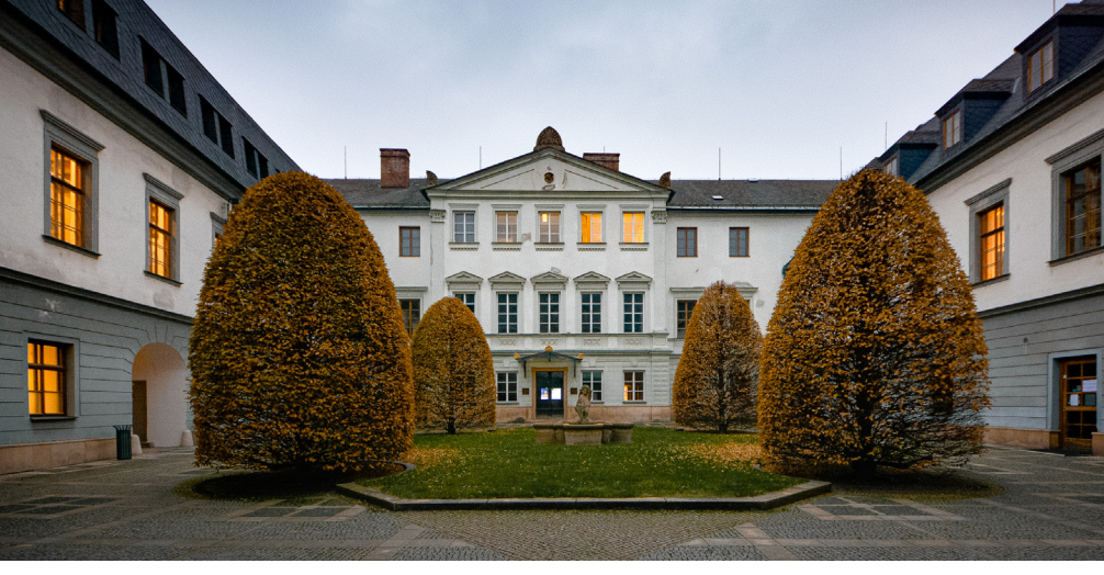
↑ UP Rectorate

Part-time PhD students typically don't have assigned offices but may have access to a workplace depending on their specific program.